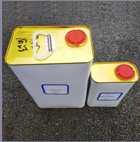
Primer / Base Coat

One set of primer is 3kg or primer main and 1 kg of primer hardener, total 4 kg.