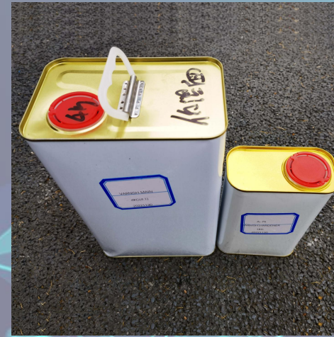
Varnish / Top Coat

One set of varnish is 4kg or primer main and 1 kg of primer hardener, total 5 kg.